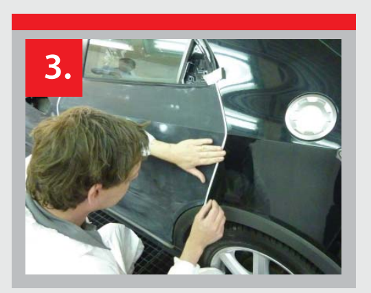
3. Check to ensure the tape is firmly located in all the gaps.