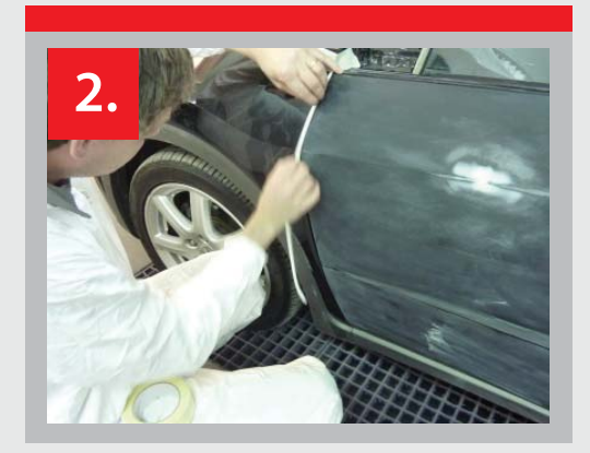
2. Apply the tape in the gap smaller side first. Locate the tape in the gap so that it sits in the central groove.