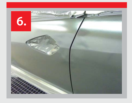
6. Remove the tape before baking.

JTAPE Limited, Hulley Road, Macclesfield, Cheshire SK10 2SF United Kingdom Tel: +44 (0)1625 618185 Fax: +44 (0)8701 207748 Email: info@jtape.com www.jtape.com