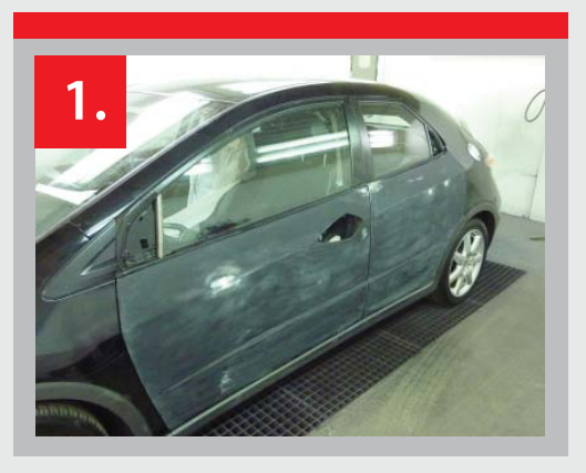
1. Prepare the vehicle before masking.