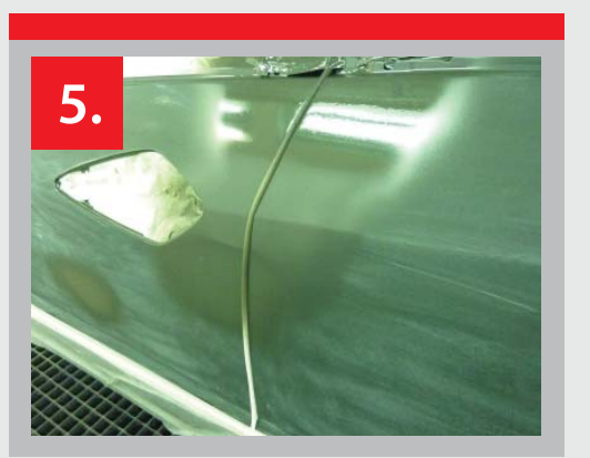
5. Prime the desired areas.