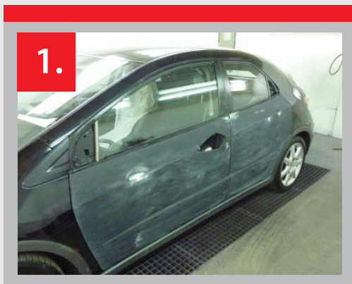
1. Prepare the vehicle before masking.