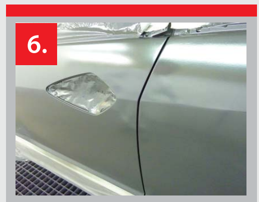
6. Remove the tape before baking.