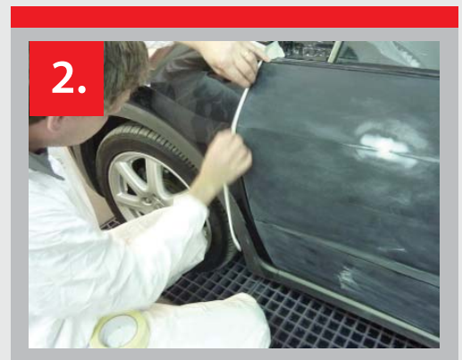
2. Apply the tape in the gap smaller side first. Locate the tape in the gap so that it sits in the central groove.