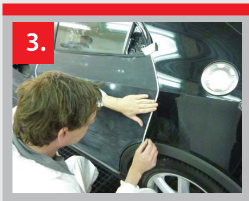
3. Check to ensure the tape is firmly located in all the gaps.