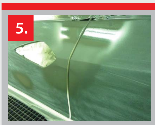
5. Prime the desired areas.