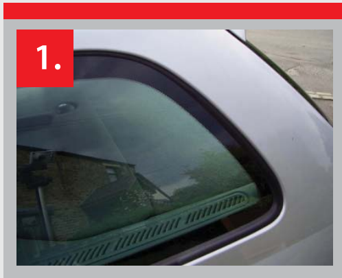
1. Choose area to be masked