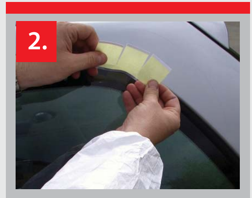
2. Tear off a small section to mask a tight corner and tear the tape down to the plastic section. Then slide in between the rubber trim and bodywork.