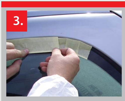
3. To mask along a straight section, tear off a section no longer than 20cm, slide in and leave back the trim ensuring it overlaps the last piece.