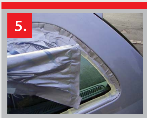
5. Allow paint to dry and remove all the masking materials.