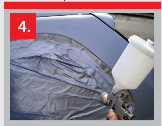
4. Mask as normal and paint.