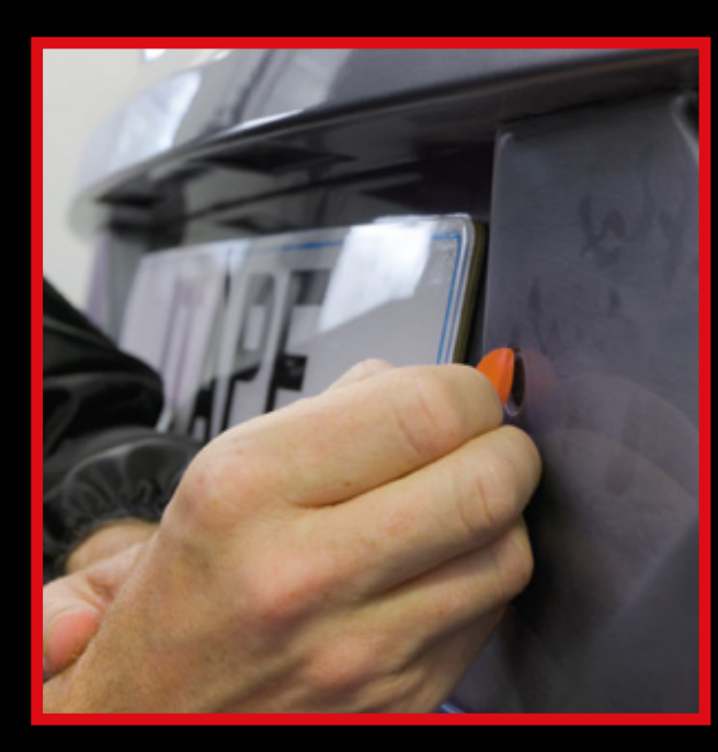
Push back on itself